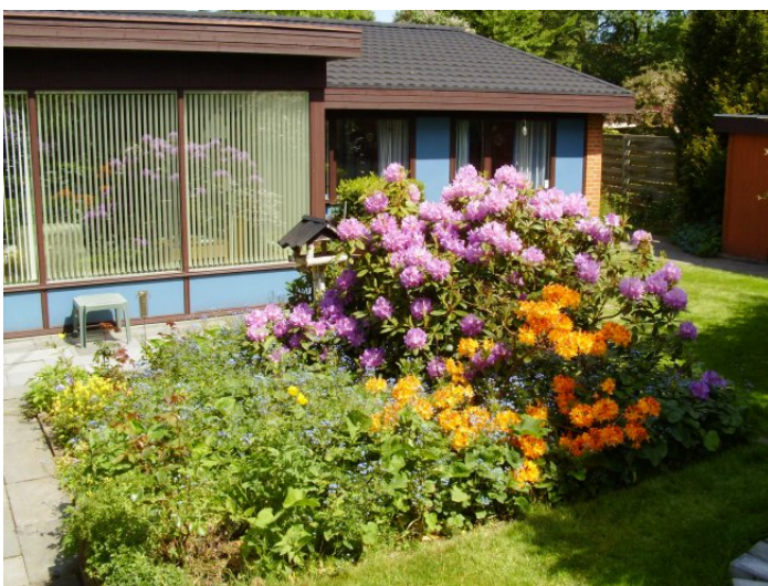
Late in spring our rhododendrons and azaleas are flowering