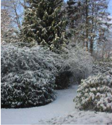
Our south garden