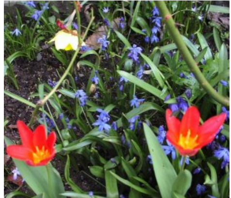
Tulipa kaufmannii and Scilla sibirica