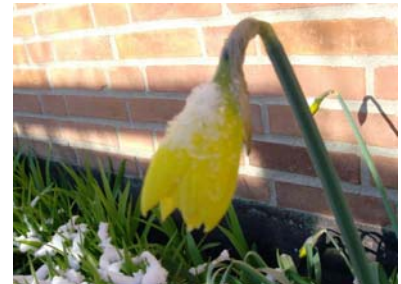
A Daffodil covered with snow is a rare sight