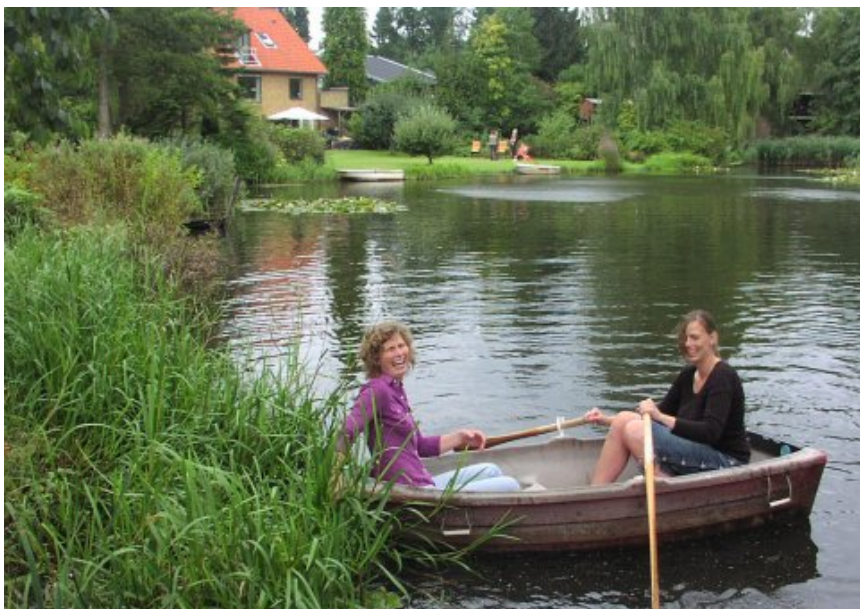
Two of our neighbours are rowing in one of the smaller boats which people around the lake let us use for this occasion.

When winter comes this story starts from the beginning.