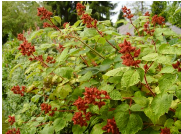
Rubus phoenicolasius (Wineberry) flowering. Related to raspberries with delicious, small, red, waxy berries