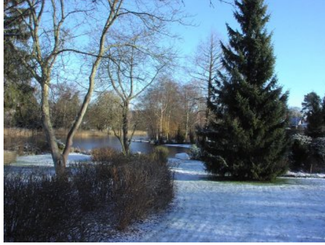
Our north garden. In the background our frozen lake - Nydam.