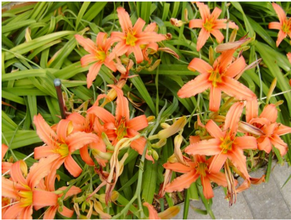
Hemerocallis aurantiaca (Daylily)