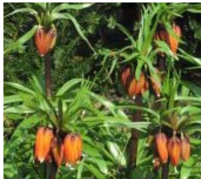
Fritillaria imperialis (crown imperial)