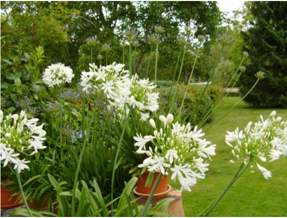
White and blue Agapanthus on our terrace