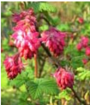
Ribes sanguineum (flowering currant)