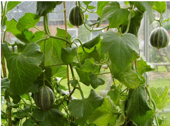
Melons growing in our greenhouse