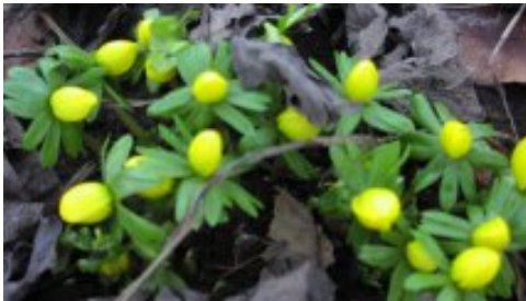
The first flowers coming up even before total snowmelt are Eranthis and Snowdrops.