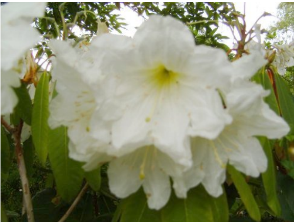
A late flowering Rhododendron with very large white flowers, probably Rhododendron maximum